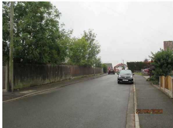
View along Darkey Lane, toward Toton Lane, with boundary to the site on the left