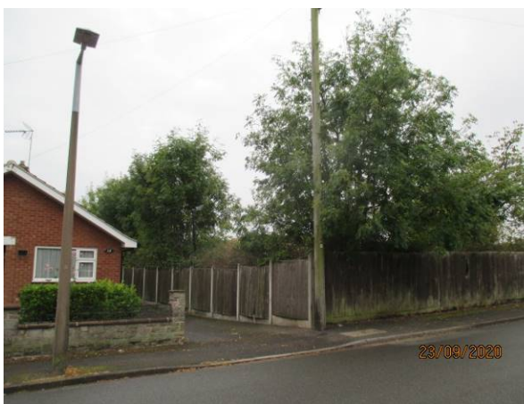
14 Darkey Lane, to the north of the site