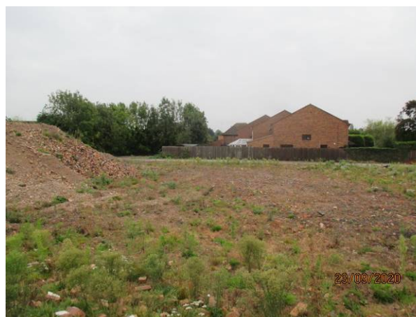
View across the site from Darkey Lane