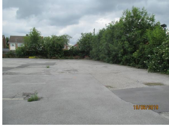
Rear boundary (east) to common boundary with dwellings on Brunswick Drive