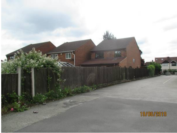
The rear elevations of 193, 195 and 197 Toton Lane