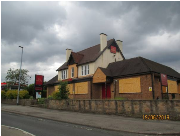
The Magpie PH, following closure and prior to demolition