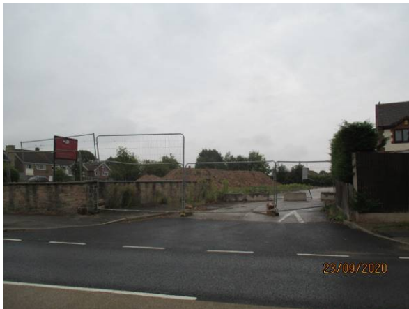
Access onto the site