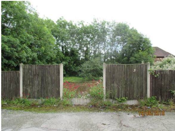
Piece of land between 193 – 197 Toton Lane and 7 and 9 Brunswick Drive, which will be allocated for parking