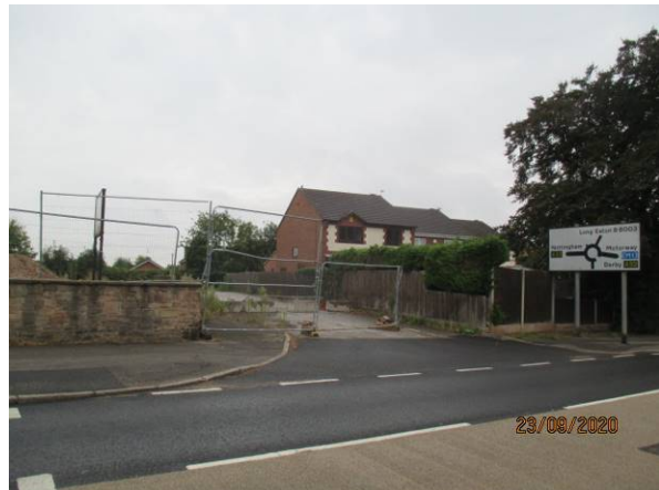
Existing access from Toton Lane, 193 can be seen to the right